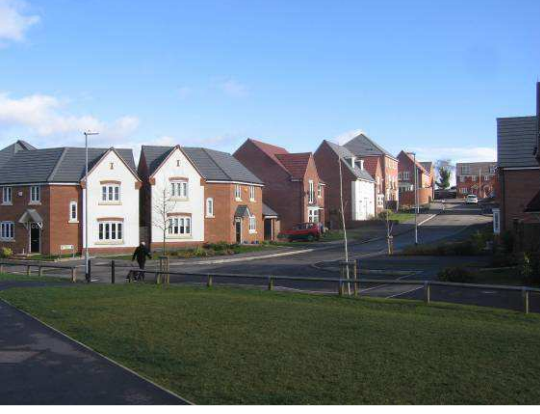
Footpath linking up to surrounding areas and providing natural surveillance

The Safer Places Chapter provides more detailed guidance on designing out crime.