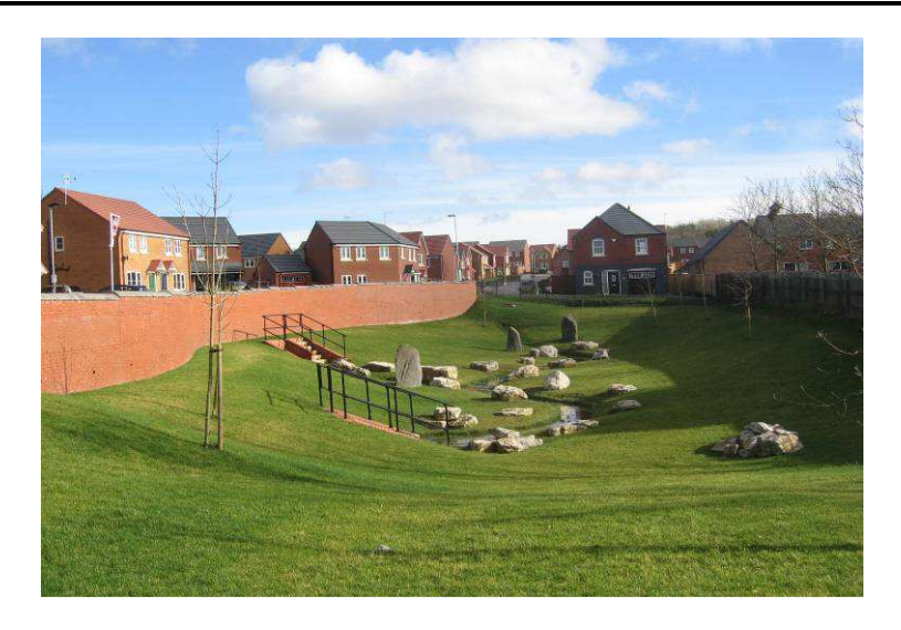
Example of a Sustainable Urban Design Drainage System (SuDS)