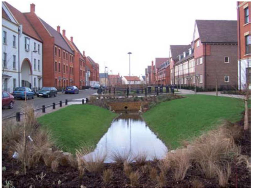
Manual for Streets identifies that SuDS systems Can be successfully incorporated into streets