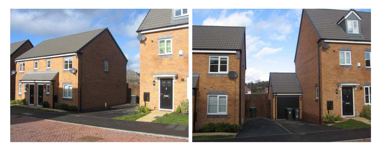
Parking discretely positioned between houses minimising the visual impact on the street scene