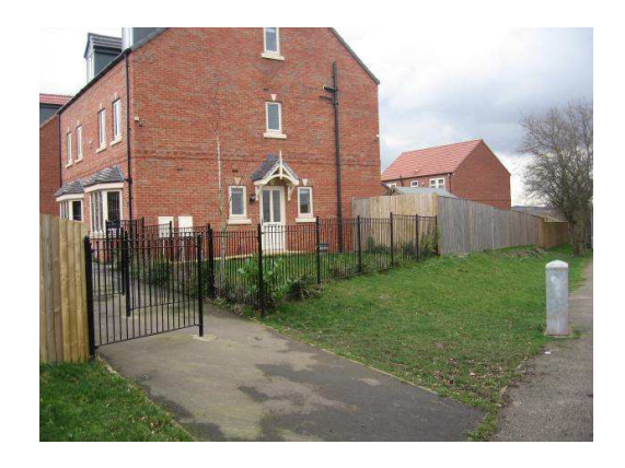
New residential development connecting the existing public footpath and providing natural surveillance