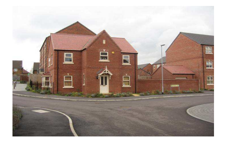
Building turns the corner with active frontages to both streets