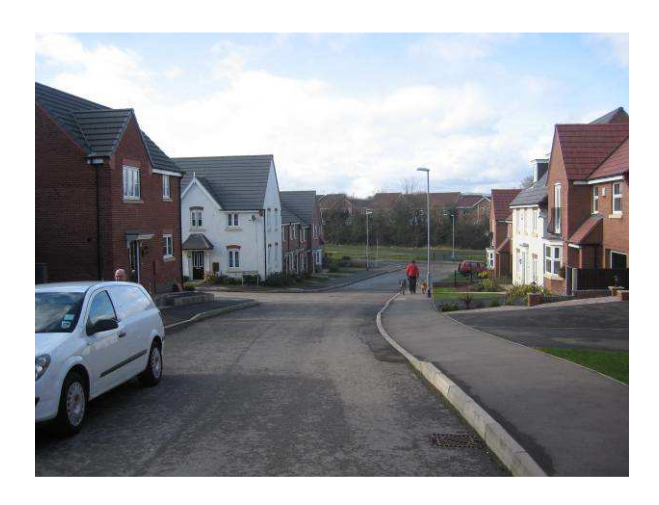
Residential development provides clear sight of public open space/footpaths, providing safe access along pavements for pedestrians

3.28 Streets and footpaths should be well defined so that all users can easily navigate a route through the development. There should be clear sight lines to important buildings, public spaces and points of activity. Landscape treatments and architectural features should be used to define public spaces and routes.