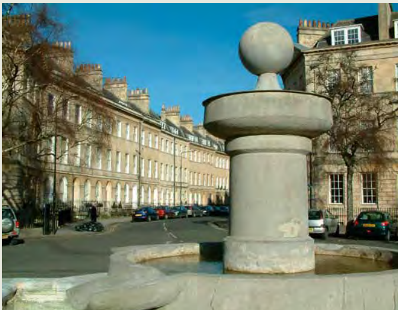
Laura Place, Bath.

2.2.28 This section lists references to the principal sources of historic and local information, a short glossary of relevant architectural and vernacular terms, an audit of heritage assets, the criteria used for assessing the contribution made by unlisted buildings in the conservation area (see table 2) useful names and addresses (of both national and local organisations) and the local authority's contact details for enquiries and comments.