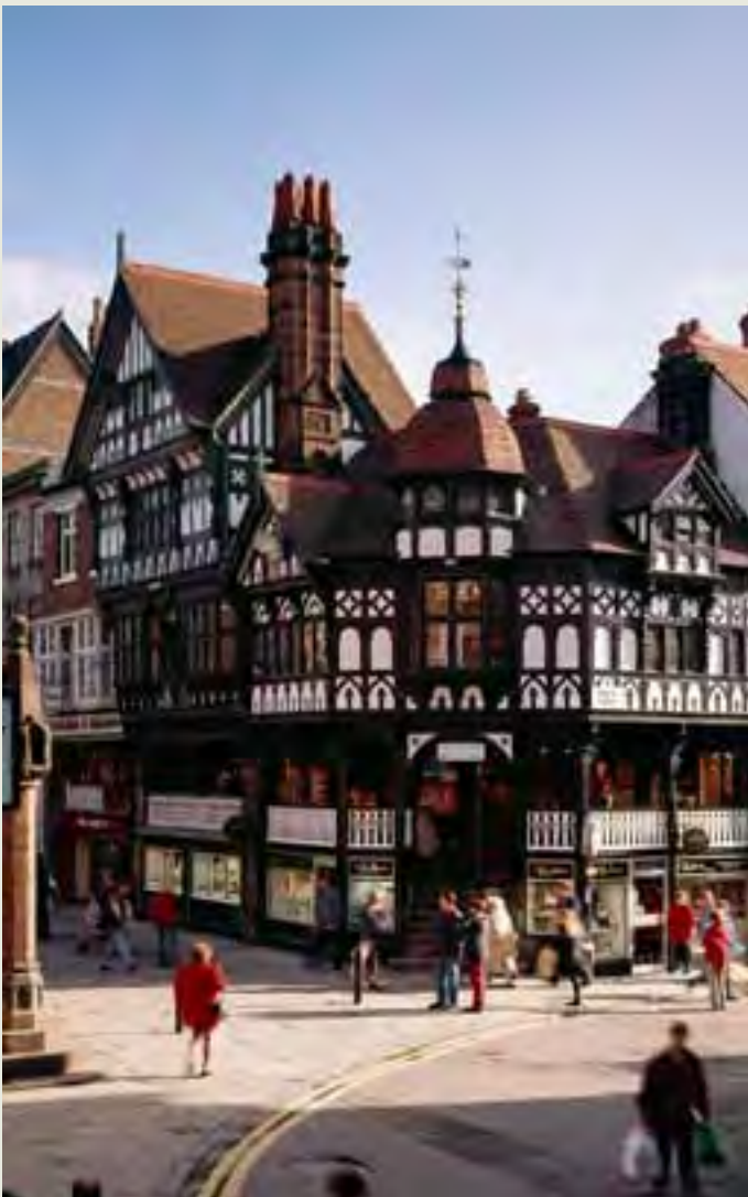
Chester Rows.

2.1.7 The decision on whether the appraisal should be adopted as part of the Local Development Framework (LDF) is a matter for the local planning authority. Some authorities, Tunbridge Wells for example, have adopted conservation appraisals and management plans together as Supplementary Planning documents (SPD) whereas others regard the appraisal itself as part of the evidence base and adopt the management plan including development management policies in the LDF as SPD. Inspectors have accepted appraisals as material considerations of considerable weight in appeals whether or not they have been adopted as SPD.