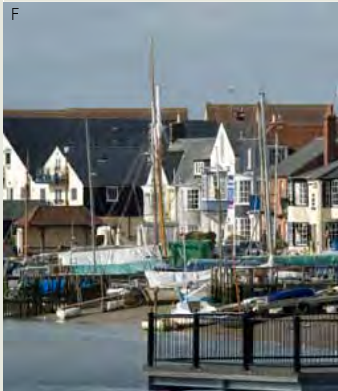
F The Quay, Wivenhoe, Essex.

Wivenhoe's location on the Colne estuary is of prime importance to the economic history and development of the town and the rising ground contributes greatly to its character and townscape. The view from the South into Wivenhoe of the quayside forms a strong boundary at the southern edge, particularly since there is no settlement immediately visible on the opposite bank. The Quay is an attractive mix of old and new buildings with a maritime flavour lent by the bow and oriel windows and balconies, as well as painted weatherboarding. Further west the old shipyard, now developed for housing, picks up the style of the Quay with weather boarded houses in a vernacular style and various colours. Despite this, however, the redeveloped upriver shipyard squeezes the conservation area on its western edge. To the east, the other shipyard is currently under development and its design attempts to create a better relationship with the existing quay area.