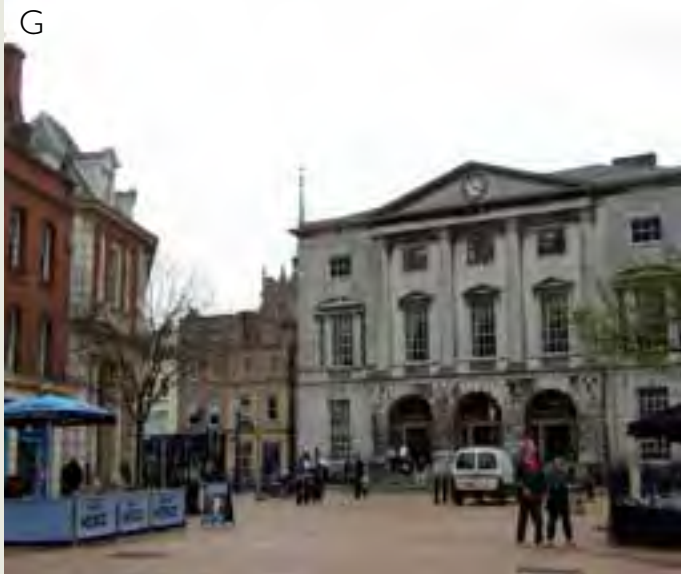
G Shire Hall, Chelmsford, Essex.

In 1199 a charter was granted by King John for a weekly market to be held. Further charters gave the right to sell off plots of land for building and for an annual fair. The site of the market was an elongated triangle, stretching from Springfield Road up to the parish church (now the cathedral). Long, narrow rectangular plots stretched down from a High Street frontage to the River's edge. The market place is still instantly recognisable in the current High Street layout. Some of the narrow plots also survive. The continuous retail use of the High Street from the medieval period means that the historic street pattern has been retained, although most of the buildings have been replaced, several times in some instances. The centre of the market place was progressively infilled from the fourteenth century with permanent buildings. Chelmsford's central position in the county and being on the primary route to East Anglia allowed it to prosper during the medieval period. Inns, hostels, blacksmiths and carriage makers served the needs of travellers. The fertile agricultural land around the town made it the natural centre for trading. The plentiful water supply available allowed various industries to develop, including brewing, flour milling and tanneries.