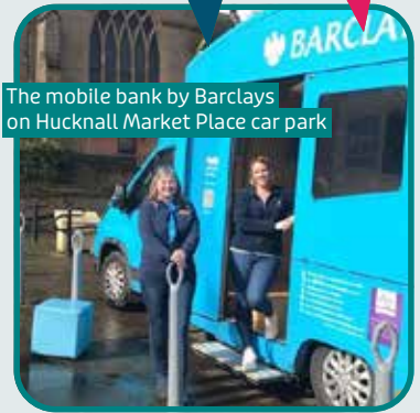
The mobile bank by Barclays on Hucknall Market Place car park