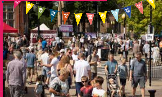
Thousands of people browsing the stalls at the Food and Drink Festival in Hucknall

We will continue to work to improve and enhance all three town centres in Ashfield to ensure they are fit for the future, allow businesses to prosper, and offer cultural experiences to help boost our visitor economy.