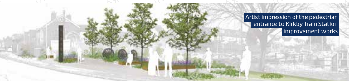
Artist impression of the pedestrian entrance to Kirkby Train Station improvement works

The gateway building itself will incorporate seating both inside and outside, and will be situated on the land next to the train station. The new building will help start the regeneration of the west side of Kirkby, creating a modern, pleasing welcome into the town centre, encouraging further external investment.