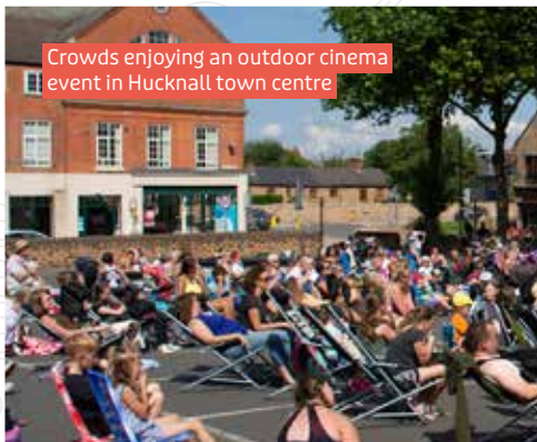
Crowds enjoying an outdoor cinema event in Hucknall town centre

As part of the project, we will improve access to the town to attract more visitors and businesses to reinvigorate the town centre. The cultural and heritage enhancements will celebrate Hucknall's rich heritage and provide new opportunities for people to learn about this history. This project will be one of the biggest investments in Hucknall for decades.