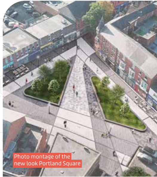
Photo montage of the new look Portland Square

Work is well underway at Fox Street to create a flexible space that can be used as a space for the outdoor market, specialist markets and events, as well as a car park.