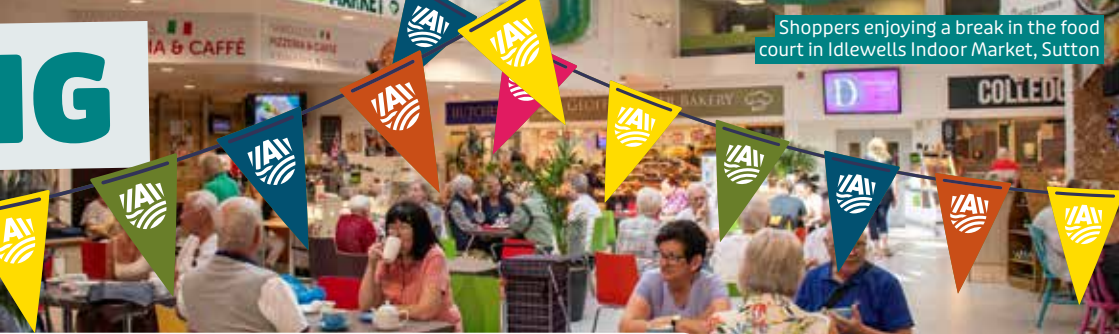
Shoppers enjoying a break in the food court in Idlewells Indoor Market, Sutton