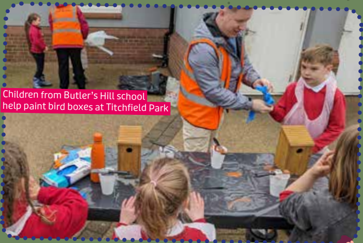
Children from Butler's Hill school help paint bird boxes at Titchfield Park