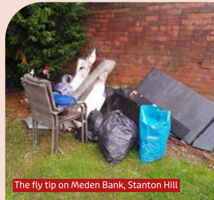
The fly tip on Meden Bank, Stanton Hill

Residents will see robust enforcement action followed by increased police patrols and efforts to build a strong community network and further enhance community safety. Hucknall's Broomhill Road and Butler's Hill area has been chosen to address residents' concerns about drug-related crime and anti-social behaviour, disrupt cross-border criminal activity from Nottingham and Bulwell, and bring additional resources to the area.