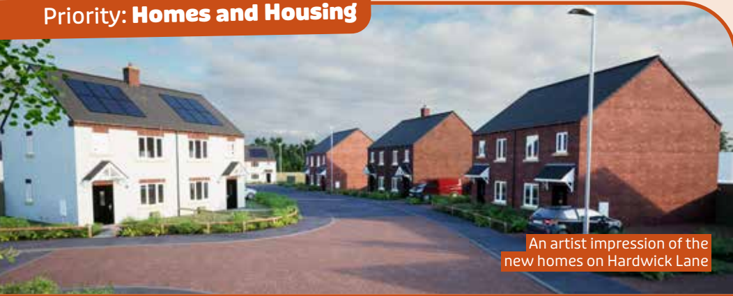
An artist impression of the new homes on Hardwick Lane