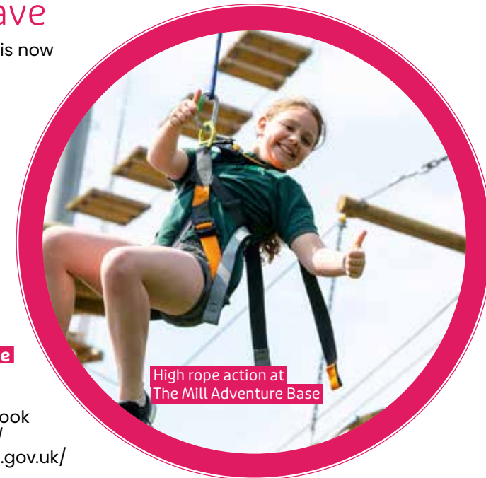
High rope action at The Mill Adventure Base

You can find out more and book your place by visiting https://adventures.nottinghamshire.gov.uk/