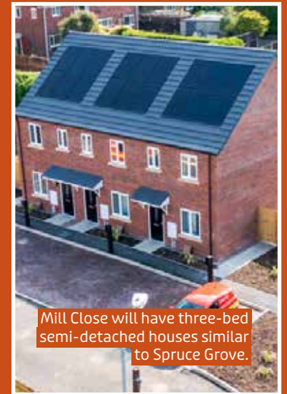
Mill Close will have three-bed semi-detached houses similar to Spruce Grove.

Mill Close will welcome two two-bedroom houses. The new homes will be thermally efficient with solar panels and other measures to reduce carbon use and make them more affordable to run.