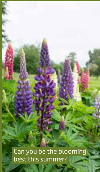
Can you be the blooming best this summer?

Anyone wanting to sell or promote any plants or garden related products is asked to contact the Markets Team on markets@ashfield.gov.uk or 01623 551385 with an expression of interest. However, it is not just for professional traders , it could be allotment holders or amateur gardeners who have grown their own plants from seed and have too many.