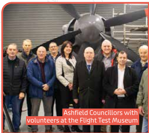
Ashfield Councillors with volunteers at the Flight Test Museum

And on 4 April the museum, in Watnall Road, will reopen, telling visitors the story of the flight and ground testing performed on engines there from 1934 to 1972.