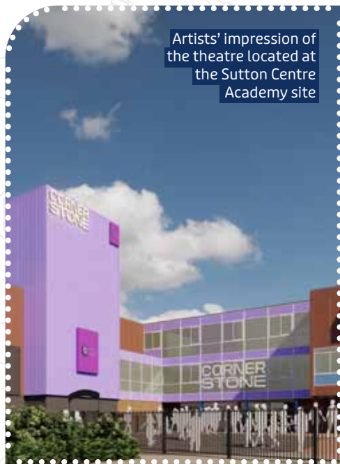
Artists' impression of the theatre located at the Sutton Centre Academy site

The reception is also progressing ready to welcome guests. The newly refurbished theatre will support access to arts and culture.