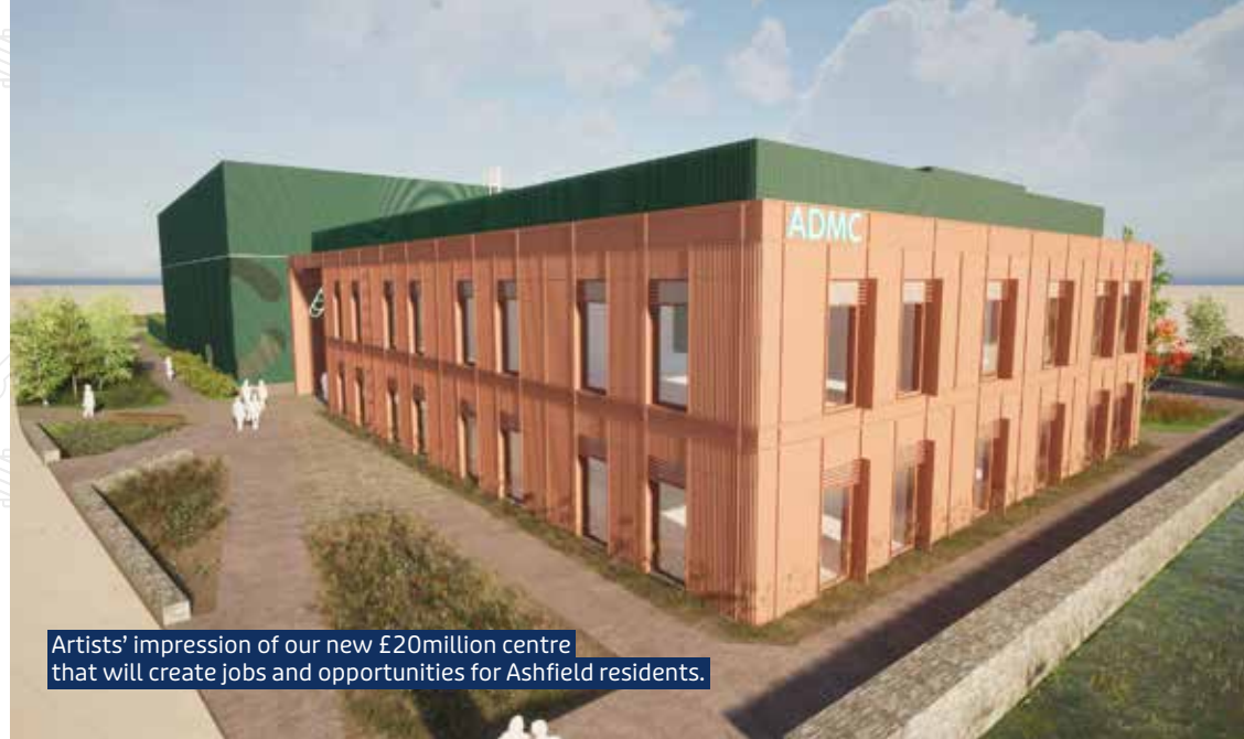
Artists' impression of our new £20million centre that will create jobs and opportunities for Ashfield residents.