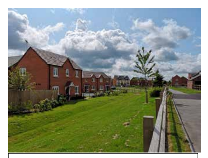
The Larwood residential development in Kirkby-in-Ashfield.

The above table shows that as of 31st March 2021, a net S106 total of £4,432,484.66 was available to fund public open space, education, healthcare, transport, public realm, and affordable housing projects in the district. S106 contributions received from the Larwood residential development at Twickenham Road, Kirkby-in-Ashfield were used to fund affordable homes on the Davies Avenue site (renamed Froghopper Lane) in Sutton in Ashfield. In partnership with social housing and care organisation EMH group and Homes England, 22 new homes are being constructed including six three-bed houses, ten two-bed houses, four two-bed apartments and two bungalows. One of the bungalows is wheelchair adaptable.