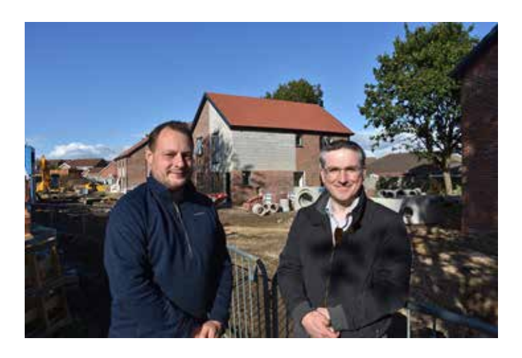
The Council Leader and the Portfolio Holder for Planning and Regeneration at the affordable housing scheme on Froghopper Lane in Sutton -in-Ashfield