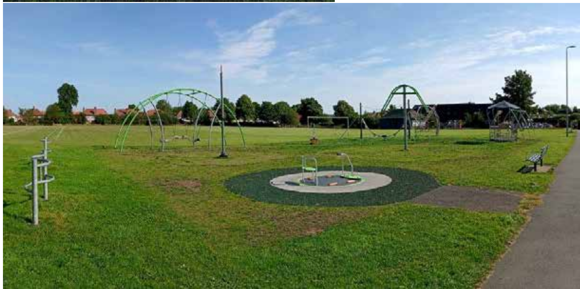
Healdswood Recreation Ground: New play equipment