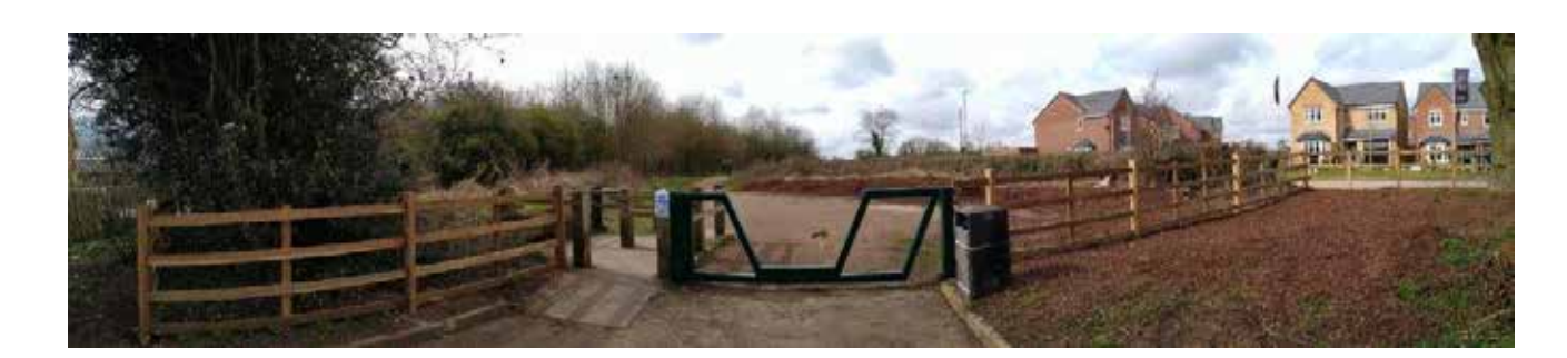
Brierley Forest Park: Brand Lane Entrance Improvements