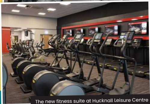
The new fitness suite at Hucknall Leisure Centre

Good progress is being made at the Hucknall Leisure Centre swimming pool following the news in December 2021 that the £2.7million teaching pool was given the green light by Ashfield District Council's Planning department.