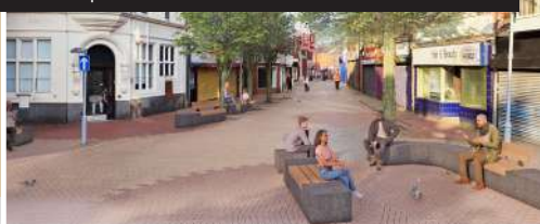
Artist's impression of the new street furniture on Low Street

Low Street: Work has started on the renovation of the derelict Yorkshire Bank on Low Street in Sutton. The building is being transformed to house two new retail units on the ground floor, and new residential apartments on the first floor. The renovation of the former bank will get rid of a grot spot in the town centre and create good quality homes. The building will meet modern energy efficiency standards to ensure lower bills for tenants whilst contributing to our net zero ambition. All enquiries for the commercial units should email: commercialproperty@ashfield.gov.uk