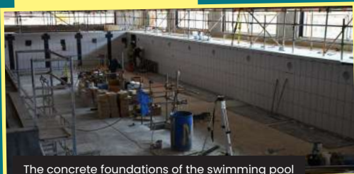
The concrete foundations of the swimming pool