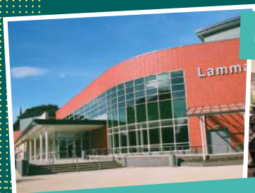
Lammas Leisure Centre

The three leisure centres included in this competition are: