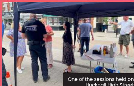
One of the sessions held on Hucknall High Street

During National Anti-Social Behaviour Awareness week, Council officers and Nottinghamshire Police teamed up to host a series of drop in sessions throughout the District. They hosted the surgeries on Hucknall High Street, Selston Country Park, and Portland Square, Sutton. Officers gained valuable insight into the issues around antisocial and nuisance behaviour that residents were facing.