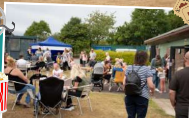
Crowds enjoying the films on Selston Country Park