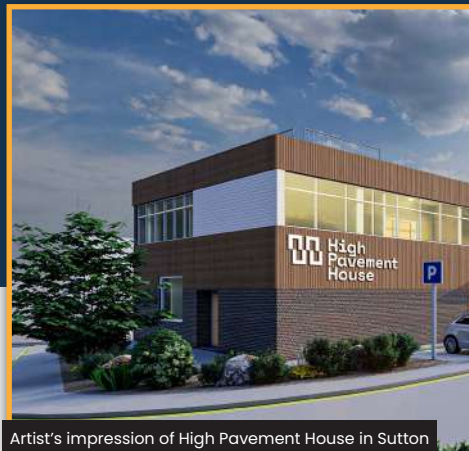
Artist's Impression of High Pavement House in Sutton

The project has been approved and will now progress to the detailed design and planning stage. The building will accommodate new changing facilities, and storage for water sports activities at the site. This will sit alongside a new space for a commercial operator to develop a restaurant offer on the first floor. The project forms part of the Towns Fund investment to boost visitor attractions in the District and to provide more opportunities for residents.