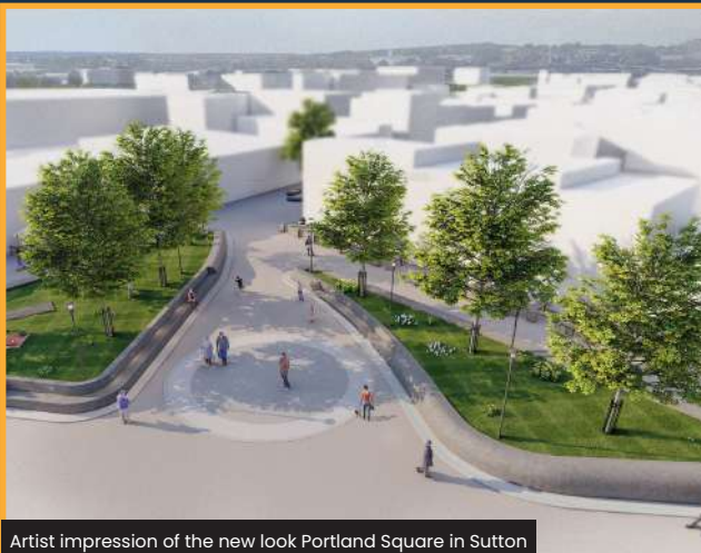
Artist impression of the new look Portland Square in Sutton

The Council is also redeveloping the brownfield site at Fox Street as part of the Future High Streets Fund Programme. The existing derelict site will be converted into a flexible outdoor space, capable of hosting markets, events, as well as providing additional parking for cars and bicycles when events are not taking place. The improvements will create a direct pedestrian friendly route from ASDA car park to Portland Square and the southern end of the town centre.