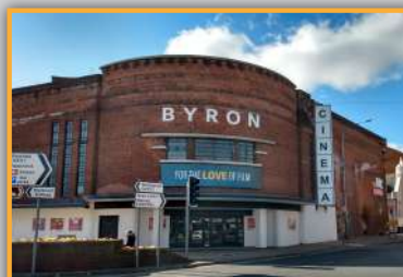
Byron Cinema in Hucknall, one of the areas featured in the Levelling Up bid