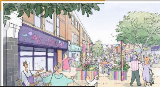
Artist impression of Hucknall High Street