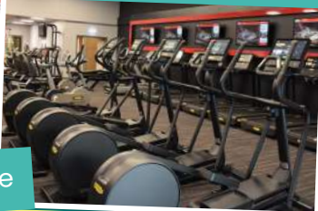
Hucknall Leisure Centre