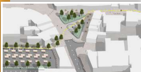
Artist impression of the renovated Fox Street and Portland Square including the pedestrian link between the sites