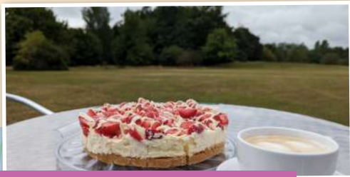
Tasty treats available from Selston Café in the Park

The café offers a range of hot and cold food, and prides itself on the local provenance of the ingredients. Visitors can choose from traditional cooked breakfasts, breakfast cobs, cold sandwiches, paninis, jacket potatoes, and sweet treats.