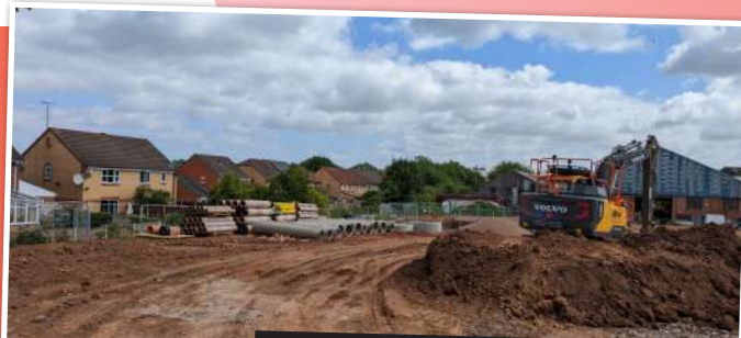
Work begins on the site of Charlotte Gardens, Sutton

Ground has now been broken on Charlotte Gardens, off Midland Road in Sutton, which will welcome 20 new homes in 2023.