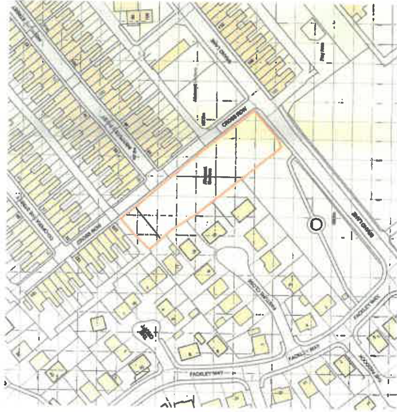
1. Site Location Plan (Scale - 1:1250)